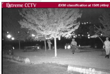
EX80 night-time imaging performance. The Image above shows Classification-level imaging at 150ft (46m).

Extreme CCTV Infrared Imagers™ are tested for performance to DCRI surveillance levels, a standard developed originally by John Johnson in his foundational work for the United States Army Night Vision lab. Johnson's Criteria provide a method of quantifying the night-time performance delivered by Extreme CCTV night vision cameras.