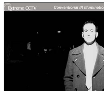
Conventional IR Illumination Background under-exposed. Foreground over-exposed.