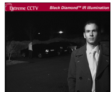
Black Diamond™ IR Illumination High-Fidelity™ performance ensures a photonicallly balanced image.