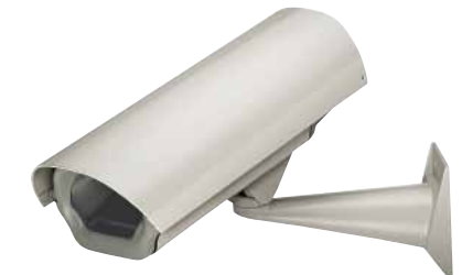
HEK30K + WBMA