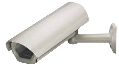
HEK30K + WB0VA2