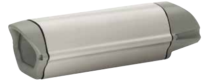
HEK30D (WITHOUT SUNSHIELD)