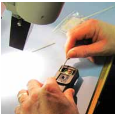
| iCAM501 Assembly in the Extronics Vision Lab

Over the past five years Extronics has made substantial investment in R & D, technical skills and production equipment to create a range of vision solutions that deliver real value to customers.