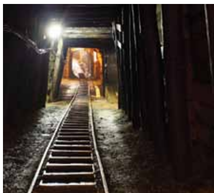
| iCAM501 Ultra has ATEX & IECEx M1 mining approval