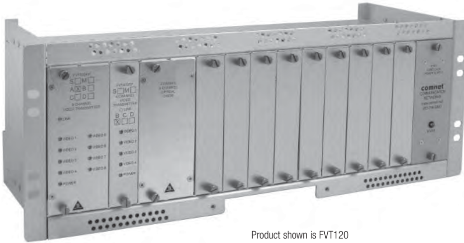
Product shown is FVT120