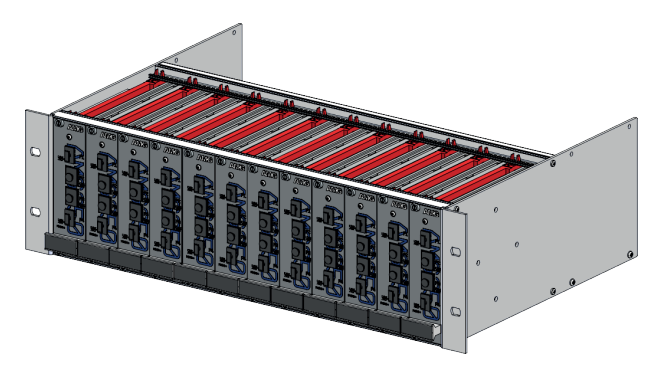
AMG2015[-DR] - 3U 19inch 12 Slot Rack