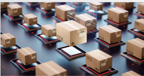
Changing the focus point and changeover for workpieces at different heights