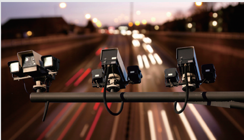
Remote adjustment in out-of-reach places and inside

Motorized FA lens that can be operated easily with a single USB cable