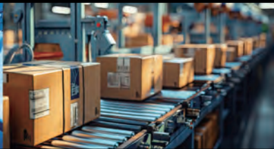
Ideal for changing the focus position and WD settings for objects of various heights.