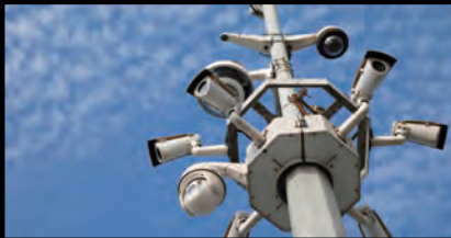
Remote adjustment of inaccessible equipment and out-of-reach positions