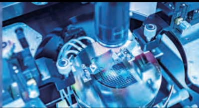
Precise modifications that do not require manual adjustment.