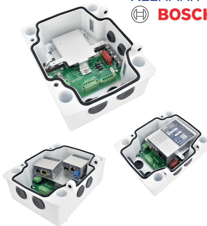
[ AMGMNT-KF* ]

The AMGMNT-KF is a dedicated custom mounting bracket solution that allows for the mounting of AMG media converters and surge protectors within compatible Keenfinity / Bosch camera surveillance cabinets.